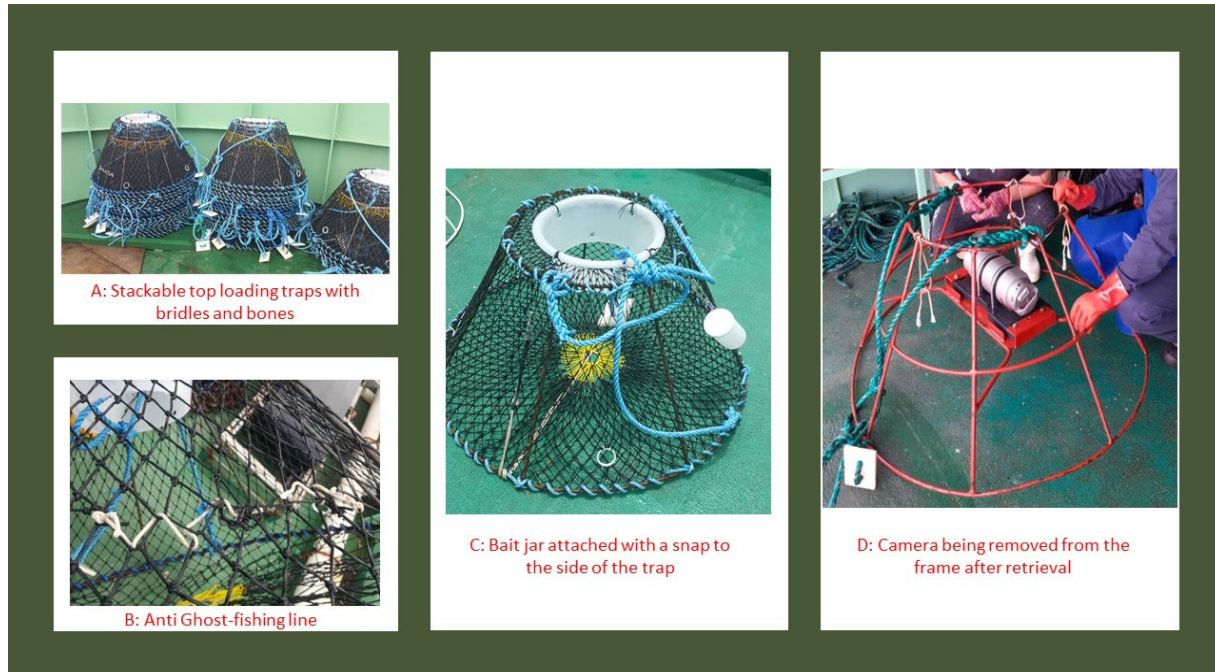
Figure A.1: Standard Type & Configuration to be used in the Exploratory Fishing Operations