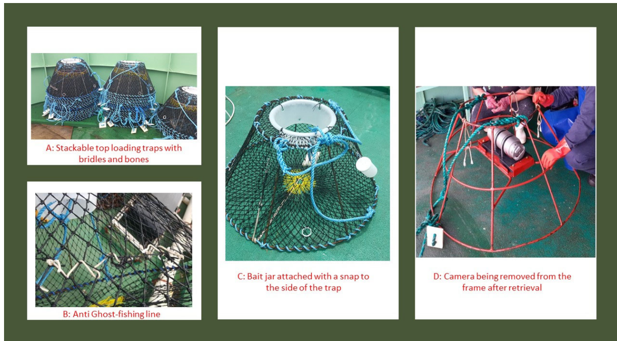
Figure A.1: Standard Type & Configuration to be used in the Exploratory Fishing Operations