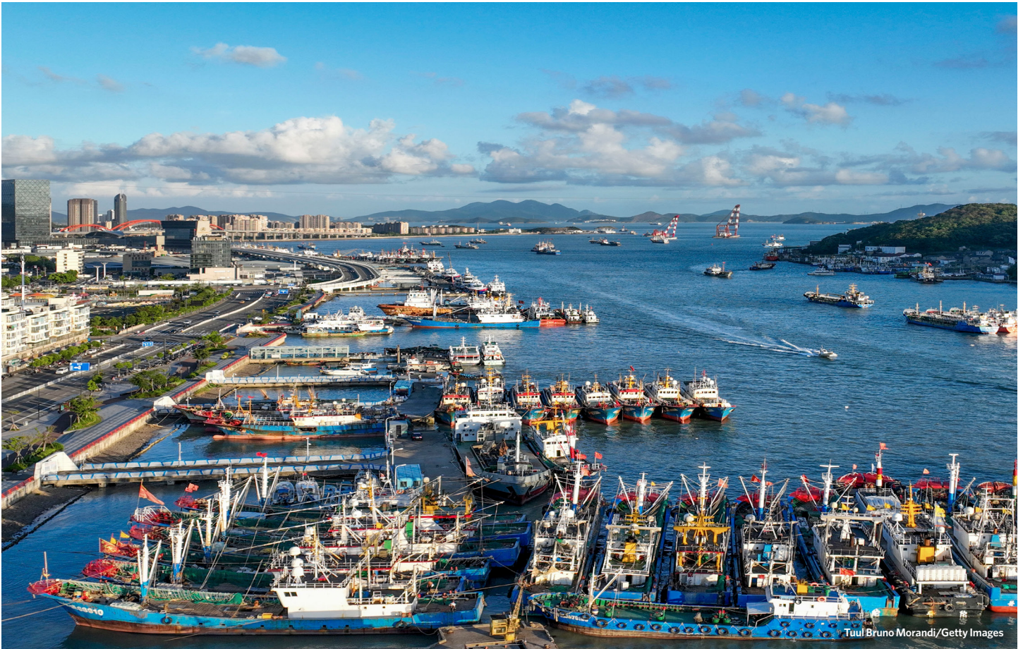
Tuul Bruno Morandi/Getty Images